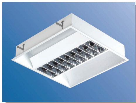
Pull up option