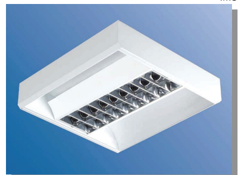
Surface mounted option SM